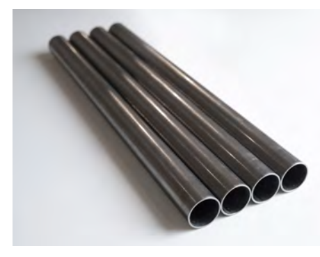
Legs for the Phoenix four-leg frame in tubular steel.