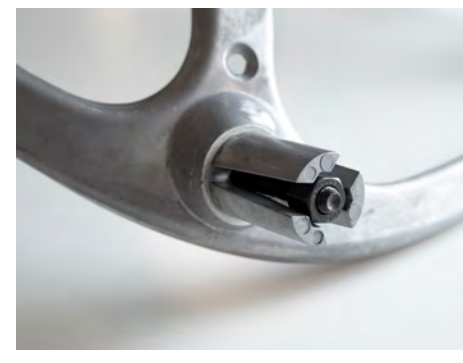
The leg attachment allows easy assembly and disassembly. Developed by Offecct R&D.