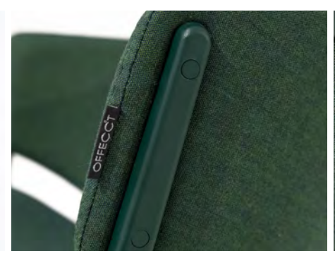
Coloured caps conceal the fastenings.